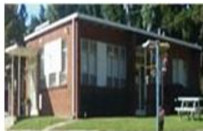
GMC Stone Mountain Extension Center