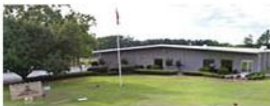
GMC Sandersville Extension Center