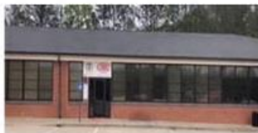
GMC Zebulon Extension Center