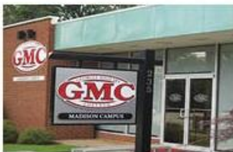
GMC Madison Extension Center