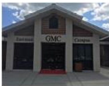
GMC Eastman Extension Center