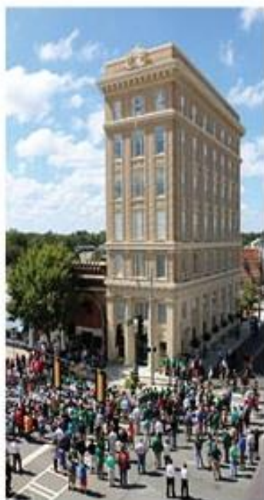
GMC Dublin Extension Center

The Zebulon extension center is the newest of the four GMC campuses in the Atlanta Metropolitan Region and provides courses for GMC students in Pike County and surrounding areas. The center is located in the Zebulon City Hall facility adjacent to Zebulon City Park at 7818 Highway 19 South. Open for postsecondary classes in March 2018, this campus offers GMC students the opportunity to complete classes toward an Associate or Bachelor of Applied Science Degree. Zebulon students, faculty, and staff have full access to library resources from the main campus and are supported by the Fayetteville Campus Library Associate.