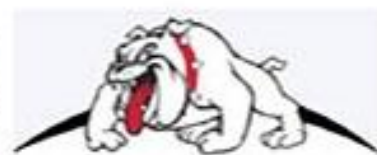
GMC Albany Extension Center